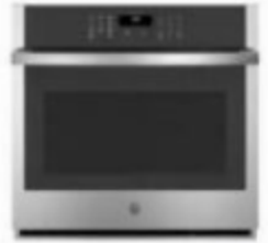
GE Single Electric Wall Oven GJTS30005N5S Stainless Steel