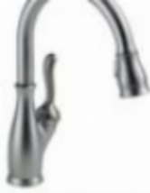
Delta Faucet Pull-Out Spray Kitchen Faucet