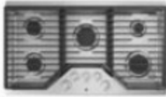
GE Gas Cooktop GJGP5036SLSS Stainless Steel